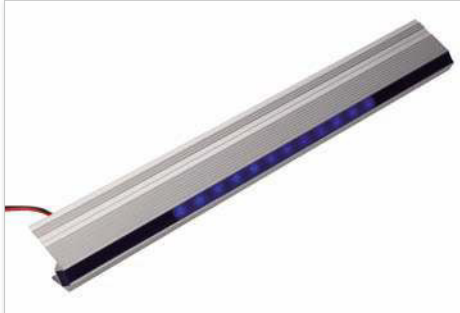
Blue-lit staircase edges reduce the risk of tripping

Our products are typically used for access stairs to crew cabins in fire engines. The product is also suitable for folding steps in fire engines, steps in public transport and for trade fairs and industrial buildings.