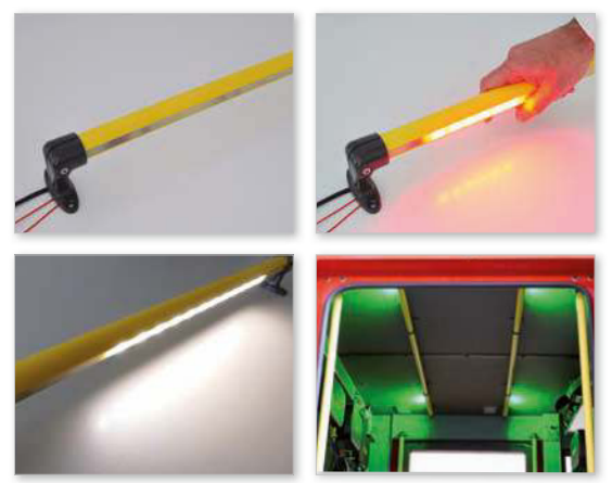
Glare-free: white, green or red lighting in the handle.

As standard, the handle is produced in zinc yellow (RAL 1018), alternatively, other colours or an anodised surface are possible. The handles are manufactured according to your specific wishes (length, light colour) within 2-3 weeks.