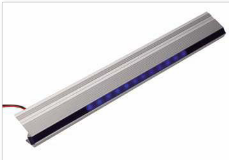
Blue-lit staircase edges reduce the risk of tripping

Our products are typically used for access stairs to crew cabins in fire engines. The product is also suitable for folding steps in fire engines, steps in public transport and for trade fairs and industrial buildings.