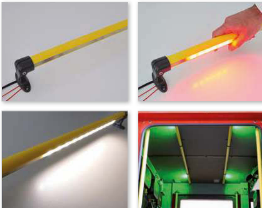
Glare-free: white, green or red lighting in the handle.

As standard, the handle is produced in zinc yellow (RAL 1018), alternatively, other colours or an anodised surface are possible. The handles are manufactured according to your specific wishes (length, light colour) within 2-3 weeks.